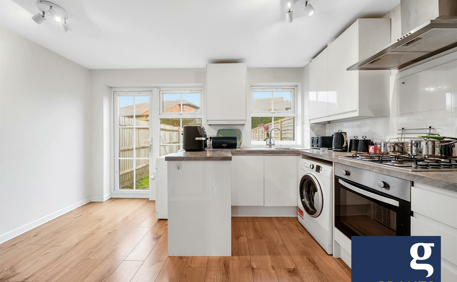
Finlay Gardens, KT15 2XL